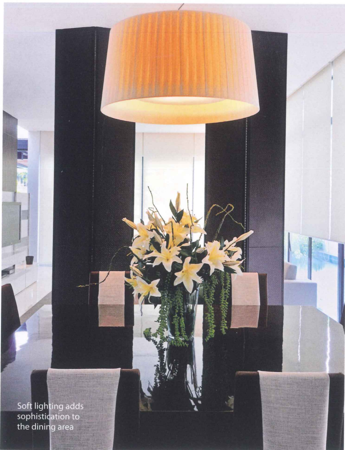
Soft lighting adds sophistication to the dining area