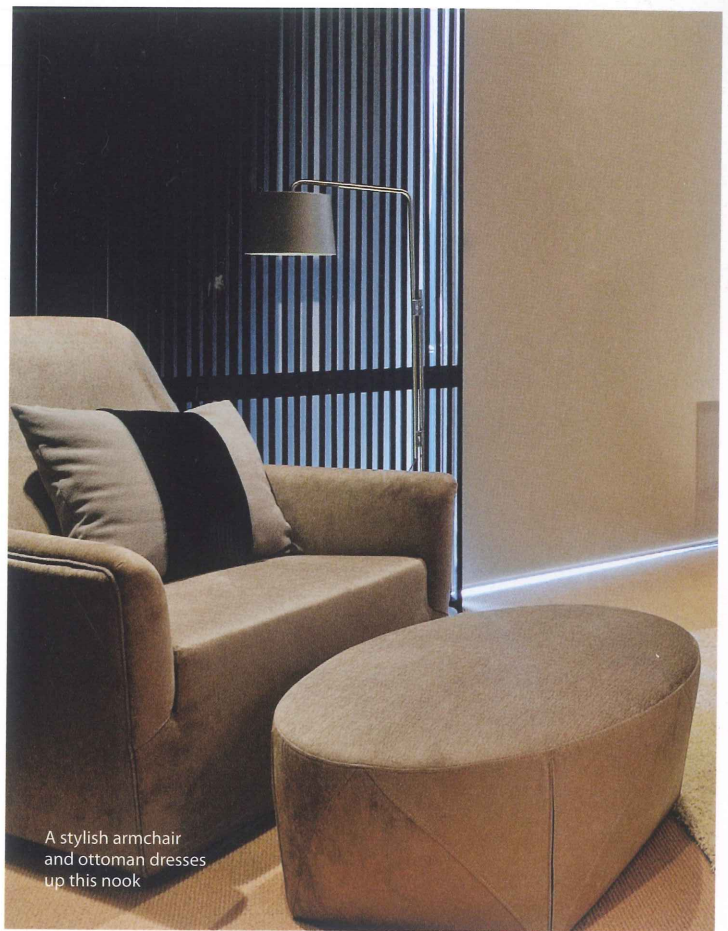
A stylish armchair and ottoman dresses up this nook

I f luxury, to you, had always been about abundance and opulence, the Gohs' residence in Braddell would have you think otherwise. Opting for a modern contemporary look with clean interiors, their home is an example of minimalist comfort, with splashes of luxury evident in the rich colour scheme used around the house.