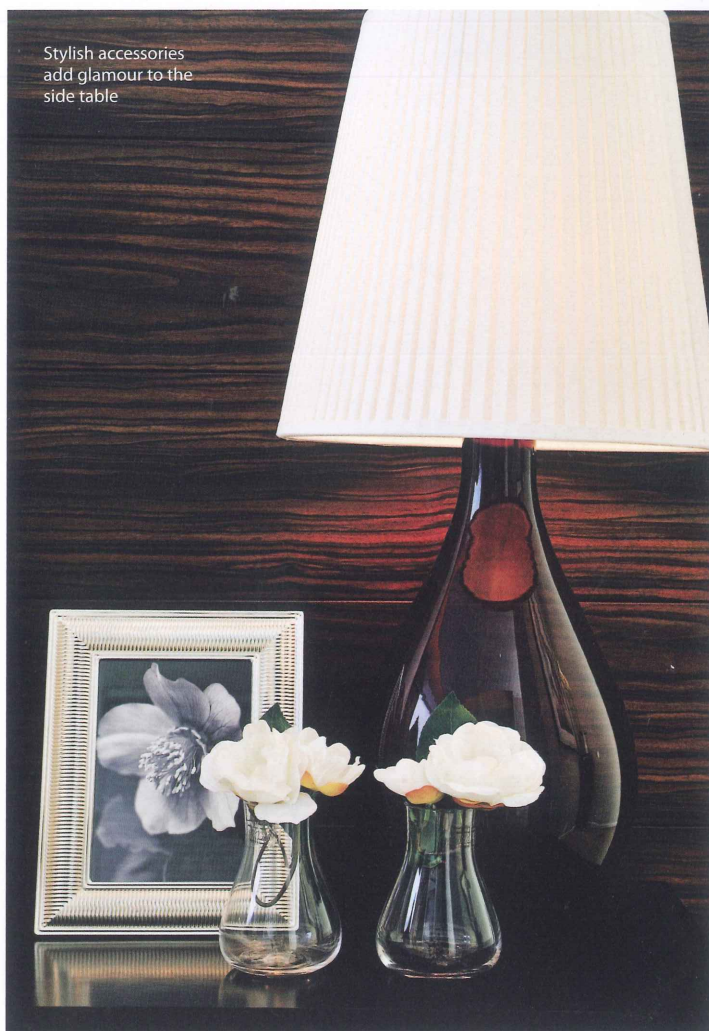
Stylish accessories add glamour to the side table