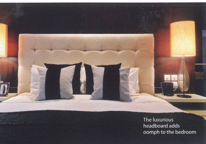
The luxurious headboard adds oomph to the bedroom